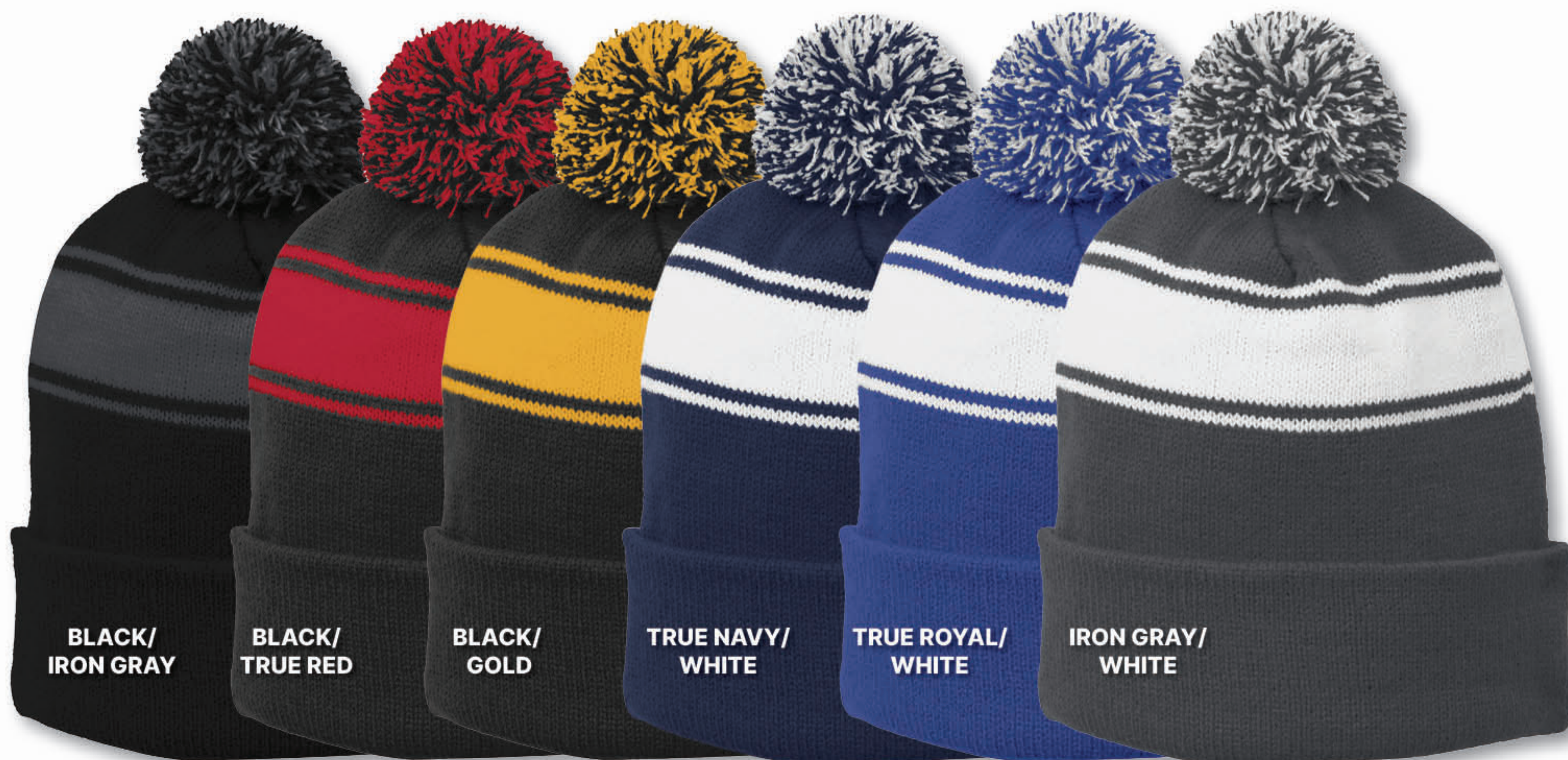
BLACK/ IRON GRAY